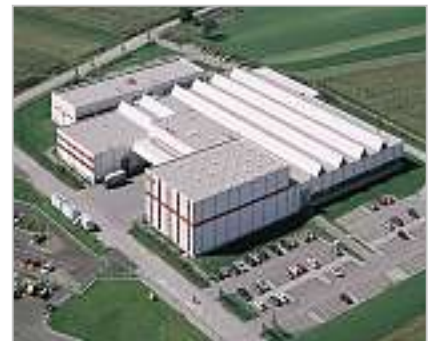
Bad Säckingen, Germany

USA/Canada SUHNER Manufacturing Inc. Hwy. 411 S/Suhner Drive P.O. Box 1234 Rome, GA 30162-1234 Phone +1/706 235 80 46 Fax +1/706 235 80 45 info.usa@suhner.com