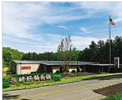
Rome (Georgia), USA

SUHNER, with over 700 dedicated employees, plants in several countries and a worldwide distribution system, ranks among the leading manufacturers in various areas of product techniques. Innovative marketing concepts derived from daily practical experience, assures that SUHNER products and SUHNER know-how are constantly brought up-to-date and are also at your disposal long-term.